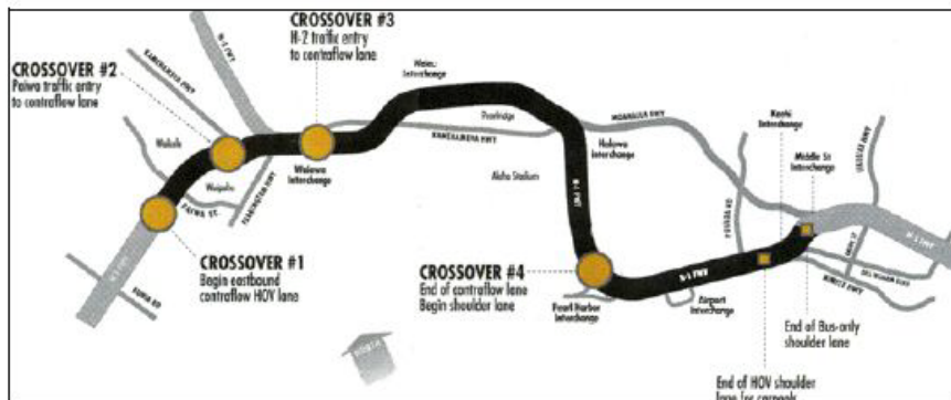
Exhibit 6: H-1 Freeway Zipper Lane Location

http://www.thebus.org/Route/Timetables/RtC.pdf Allow that the C bus to Downtown takes two minutes less than the time shown for the Kapi'olani/South stop since no times are shown for Downtown stops.